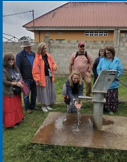
Bucket By Bucket well in Arusha visited by our mission team.

See inside of bulletin for more pictures from the mission trip to Tanzania, Africa.